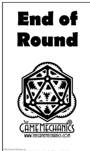
The End of Round Card