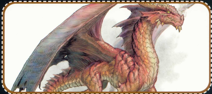
Huge Red Dragon