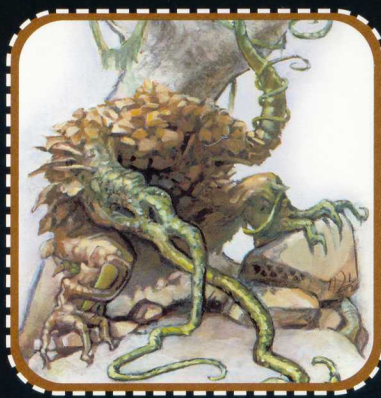
Huge Shambling Mound